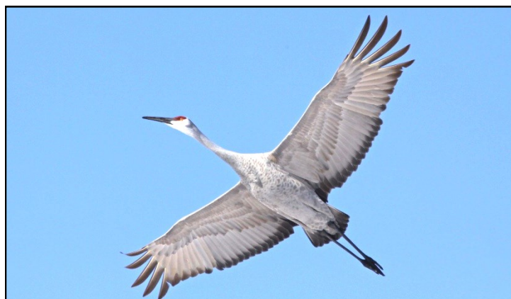
The Crane above flies with its neck out stretched in typical crane fashion. Great blue heron fly with their necks in an S curve and their heads resting on their shoulders.