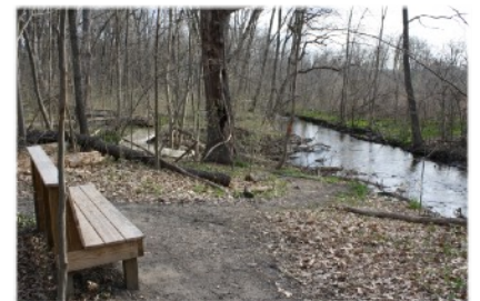
Bench along Sandstone Creek & Trail