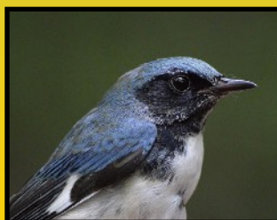
Black Throated Blue Warbler