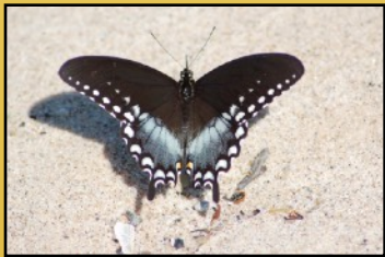
Spicebush Swallowtail Larva (below)