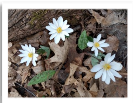
Bloodroot & Trillium are abundant in Spring

On Saturday, October 6 th , from 9:00 a.m. to Noon , our workbee will clear back woody growth from the trails and tidy up the roadsides. If you've never been to "The Kate" this would be a chance to see this special place and help in its maintenance. Bring your brush clippers (we will have clippers to use), work gloves, and grabbers to pickup roadside litter. To learn more about the sanctuary visit the Jackson Audubon web site. Text or call Allen King for more information: 517-936-1535.