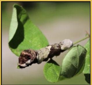
Giant Swallowtail Larva