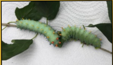
Cecropia Moth Larva